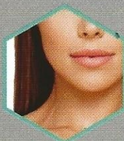
FACE / NECK